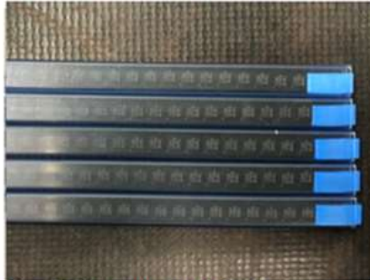
Fig-5a (Arrange the tube)