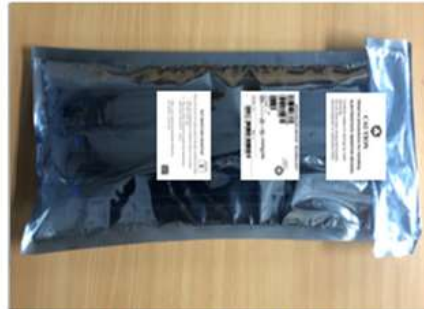
Fig-5b (Pack with Shielding bag)