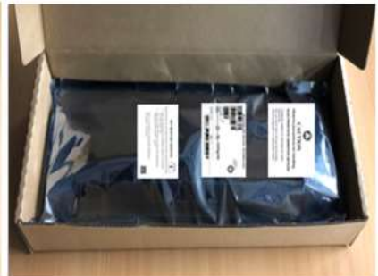
Fig-5c (Paste inner label)