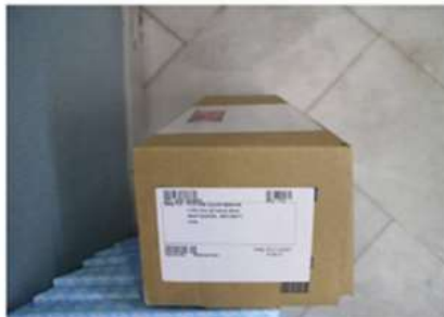
Fig-5d (Pack with Tube box)