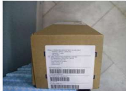
Fig-5f (Attach Outer label & Doc)